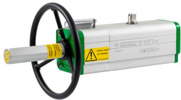
HANDWHEEL PNEUMATIC ACTUATORS