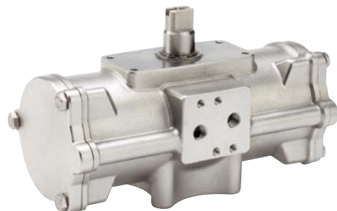
STAINLESS STEEL PNEUMATIC ACTUATORS