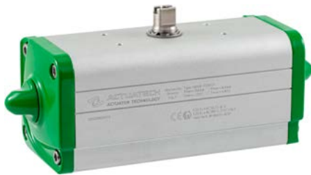
ALUMINUM PNEUMATIC ACTUATORS