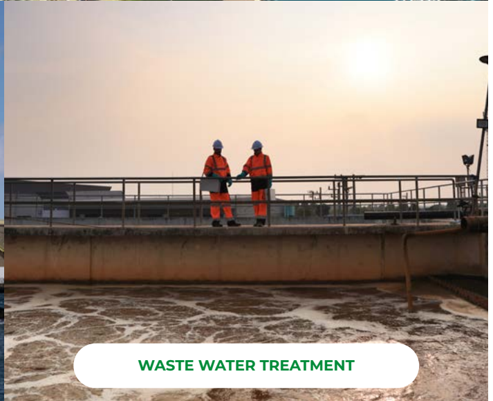
WASTE WATER TREATMENT