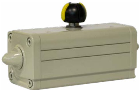
SPECIAL COATING PNEUMATIC ACTUATORS